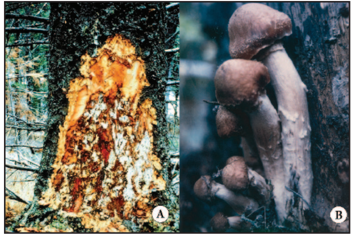
Figure 2. Armillaria ostoyae causes root and butt rot on a diverse host tree species. (A) mycelial fan beneath the bark is a sign of Armillaria disease on Douglas-fir. (B) Fruiting bodies help to identify the species of Armillaria , but fruiting is typically sporadic in nature.

A fungal endophyte lives asymptotically within plant parts (intercellularly or intracellularly) for at