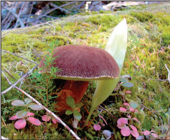
Figure 1. Fruiting body of Boletus mirabilis , a mycorrhizal fungus that is frequently associated with decomposing woody debris.

vascular and cambium tissues. They enter roots by direct penetration or by stump- or bole-to-root colonization. Although some pathogenic fungi are not predictably distributed within a forest, others (for example, root- and butt-rot fungi) can kill trees in slowly expanding mortality centers that create gaps in the forest canopy. Well-known examples of root pathogens include some Armillaria species (basidiomycetous fungi that can cause “shoestring rot”; fig. 2), Phellinus sulphurascens and P. weirii (causal agents of laminated root rots), and Heterobasidion annosum (causal agent of annosus root rot). Infection centers of root pathogens can be widespread and locally abundant, and the centers persist from centuries to millennia. Root- and butt-rot pathogens are among the most influential agents of forest disturbance in some conifer ecosystems, and they shape the structure and composition of natural and managed forests (Hansen and Goheen 2000). H. annosum is a complex of biological species specialized to pine, spruce, and fir hosts. Colonization of stumps and wounds initiates infection centers, but tree-to-tree spread along roots expands centers of infection and mortality on the appropriate host (Garbelotto and others 1997; Stenlid and Redfern 1998). Like Heterobasidion , the genus Armillaria also contains a number of poorly differentiated species, and more studies are needed to fully understand the ecological role of many such species.