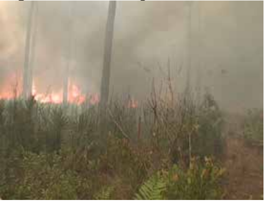
Figure 8. Low intensity flanking fire (left photo) and head fire (right photo) in site 12.