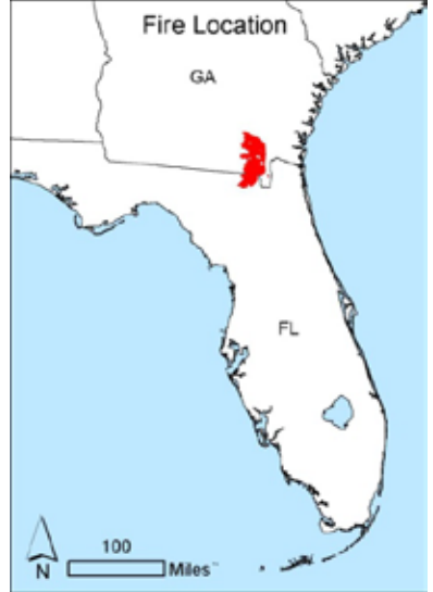
Figure 1. Fire location

Pre- and post-fire fuels and fire behavior measurements were made at sites throughout the fire (Figure 1). Sites were selected to represent a variety of fire behavior and vegetation or fuel conditions. Priority was on sites that would most likely receive fire. A rapid assessment of fire severity and effects was conducted across the portions of the fire that had burned.