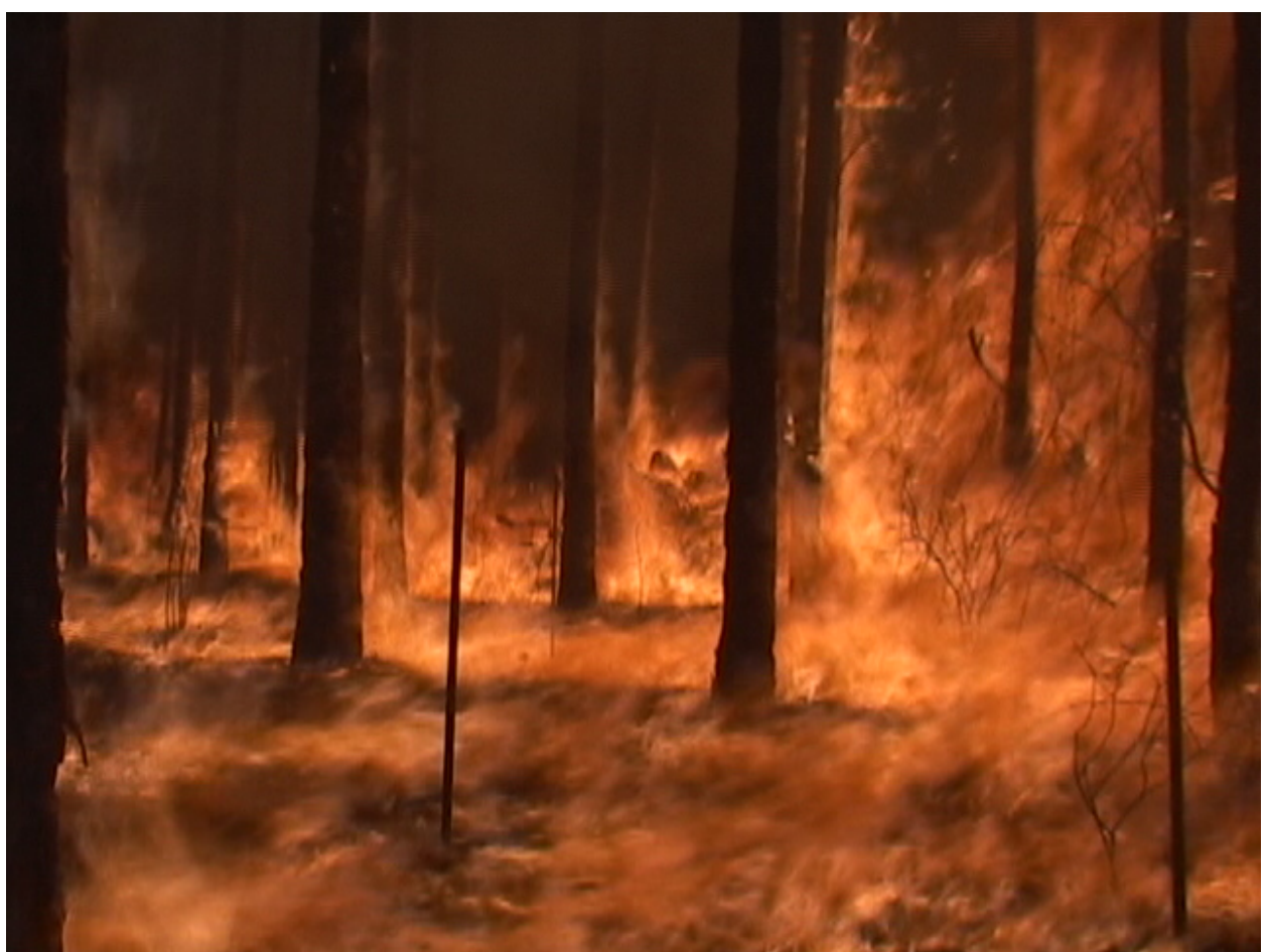
Fire burning through site #7, a 20-year old slash pine plantation