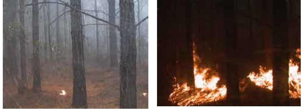
Figure 10. After spots have coalesced and merged with main head fire at site 5.

Figure 9. Spots starting in site 5 (left photo) and coalescing (right photo).