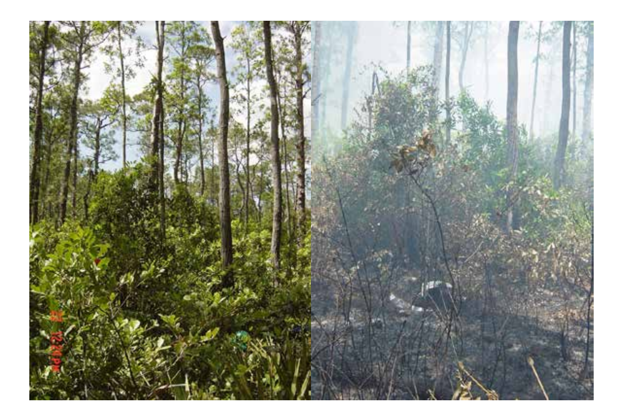
Natural Slash Pine (Sites 11, 12, 13, presented in that order)