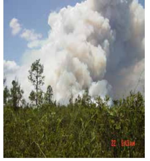
Figure 3. Fire burning toward site 2 (left photo) and then fire in the site (right photo).

Site 2 burned as a low intensity surface fire with flame lengths estimated at 5' from the video (Figure 3). Fuel consumption on this shrubby site was nearly 100%, with stems reduced to less than 1inch in height.