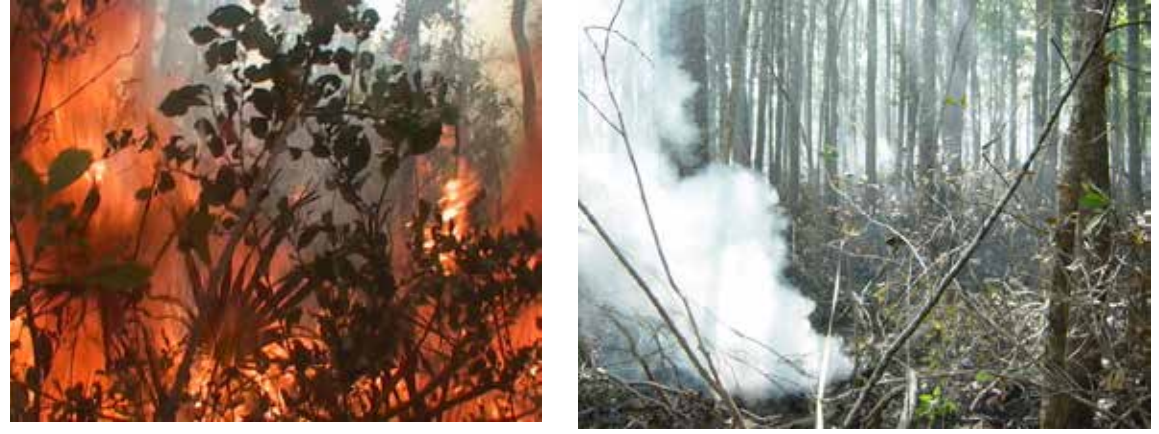
Figure 5. Fire burning through site 1 (left photo) and post-fire at the same site (right photo).

Figure 4. Fire burning through site 3 (photo on left) and later lingering combustion (photo on right).