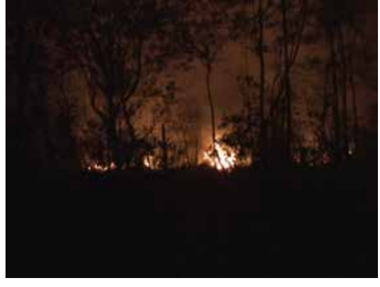
Figure 6. Site 11 burning at night.

Sites 12 and 13 burned as moderate to high intensity surface fires during the day (Figures 7 and 8). Site 12 burned partially as a backing fire but site 13 burned as a head fire. Flame lengths at site 12 were estimated at 6 feet from the video. At site13 flame lengths were estimated at 15' from the video. Neither of the stands had overstory crown consumption. Site 12 had moderate to high crown scorch (60-95%) and site 13 high crown scorch (100%). At both sites there was heavy consumption of the understory with only stobs of shrubs and stems of palmetto remaining.