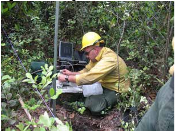
Figure 2. Installing fire behavior sensors at one of sites.