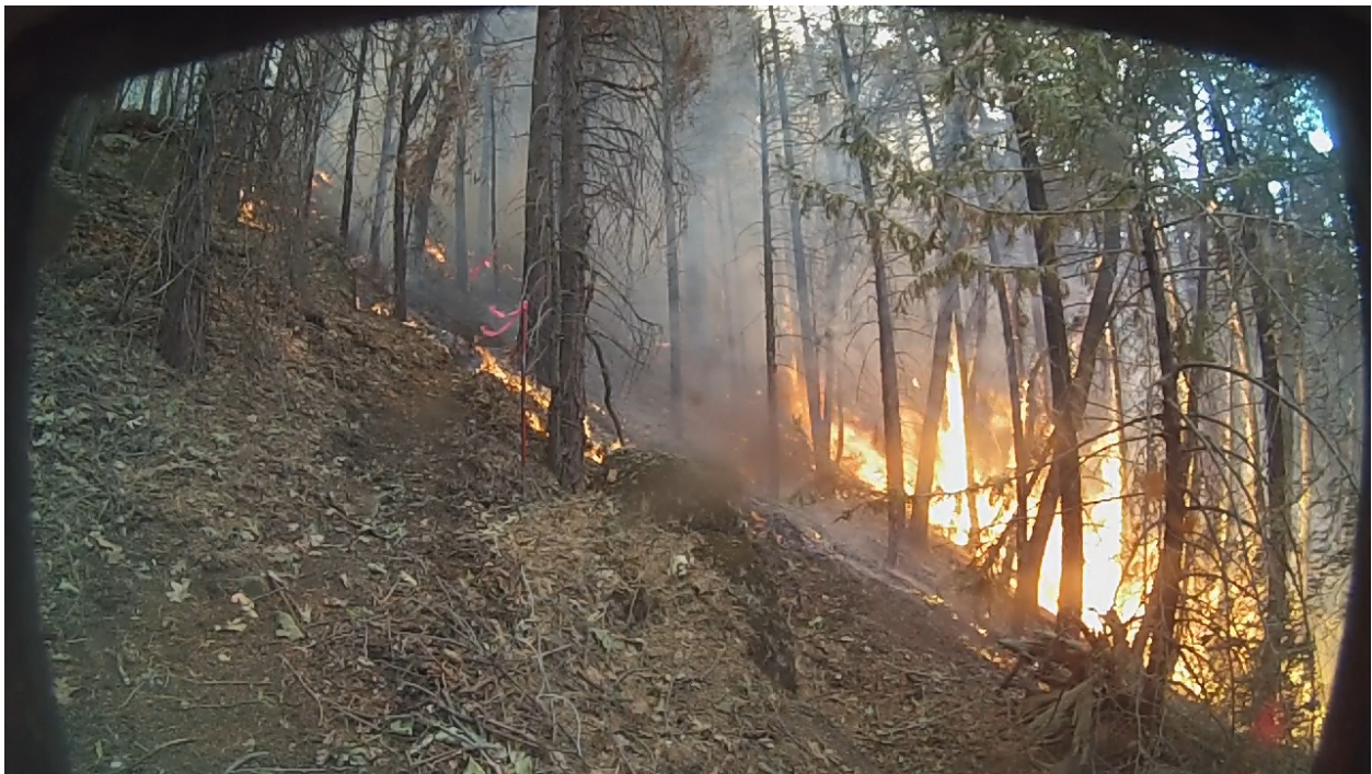
Figure 3. Leeward flaming on incense cedars that may be a mechanism by which their crowns are ignited.

Probability of torching is likely a key mechanism by which dead trees influence crown fire behavior. Low moisture content of dead foliage would reduce the energy required for ignition and combustion and the critical surface fireline intensity required for crowning (see below). Over 130 single-tree and small-group torching observations during the Cedar Fire were collected in areas primarily of dead incense cedar trees. Only a few live trees were involved in group torching events and none in single-tree torching. We observed no notable increases in the presence of ladder fuels from recent dead foliage and branches, but this and associated increases in forest floor solar radiation and wind may occur in future years. We did observe incense cedar bark burning on the leeward sides of tree boles which carried fire into the tree crowns (Figure 3). Videos of flame spread up tree boles and torching behavior are posted on Youtube: https://youtu.be/3UMAEHxibAE and https://youtu.be/ssAc6zh-s6s