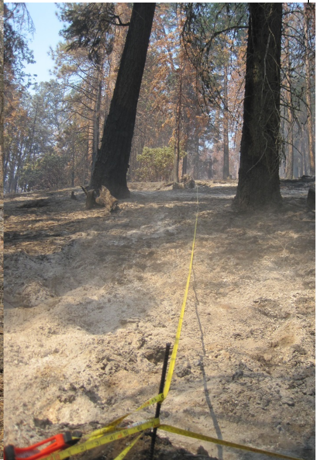
Plot 4 Transect 3, Post-fire, 50-0ft