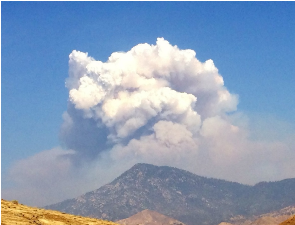
Figure 1. Plume development during August 19 th from the last major uphill run of the 2016 Cedar Fire in forested fuels.

Our fire behavior observations all occurred during wind speeds of 0-4 mph with gusts up to 6 mph, on Aug. 20-24 th , when the general direction of fire spread was only downslope, and against or perpendicular to wind. Additionally, aerial suppression actions dampened observed fire behavior on Aug. 20-21 st and 23-24 th . Fire behavior was more intense during the first several days of the fire, prior to FBAT being fully engaged. Figure 1 shows plume development from the last major run in timber for the Cedar Fire on Aug. 19 th . The fire had room to move uphill during the first several days, whereas the days when FBAT was fully engaged, fire spread was mainly limited to moving downslope.