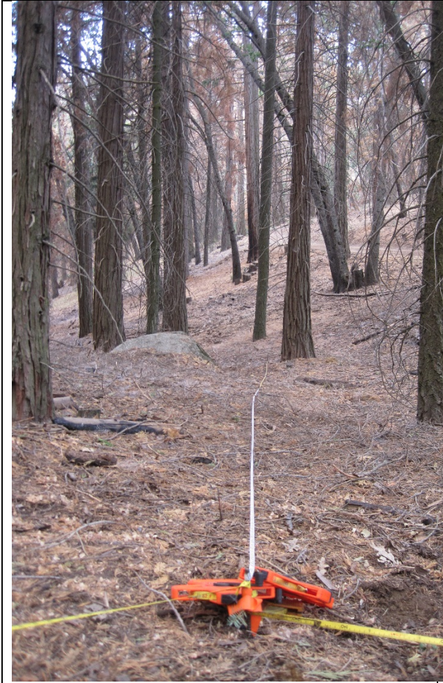
Plot 5 Transect 3, Pre-fire, 50- 0ft