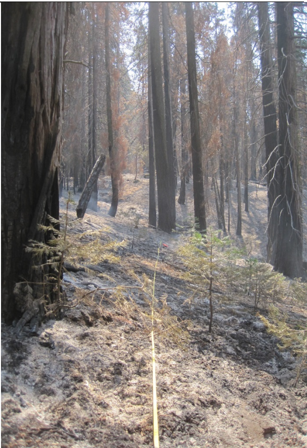
Plot3 Transect1, Post-fire 0-50ft