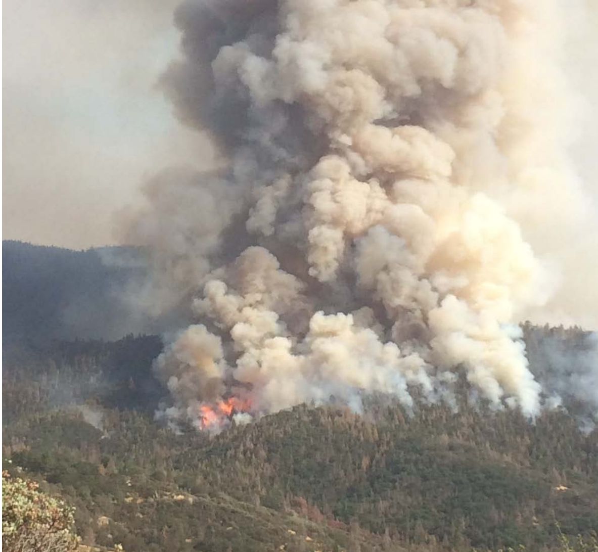
Figure 2. Photograph of a large group torching event (lower left) on August 25 th on the 2016 Cedar Fire after aerial ignition in a recent tree mortality area.

Observations during a burnout operation were made on August 22 nd that were affected by ignition operations, but not by aerial suppression (Table 1). The photograph in Figure 2 illustrates fire behavior on August 25 th during aerial ignition. This photo illustrates possible fire behavior when fire is not backing or being slowed by aerial water or retardant drops, as was the case for fire behavior observations in Table 1.