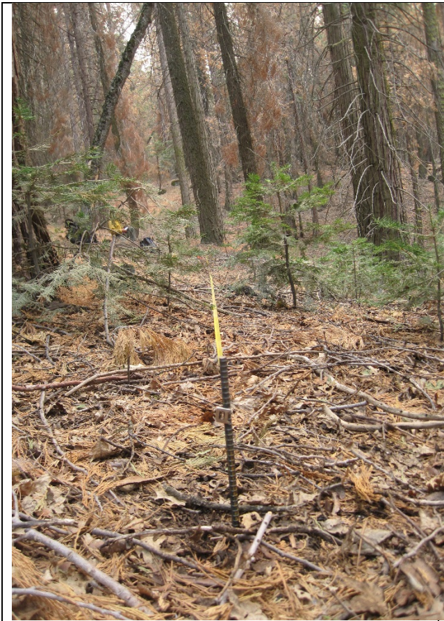
Plot3 Transect1, Pre-fire, 0-50ft