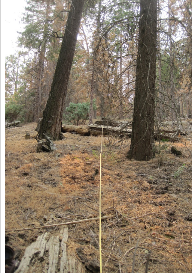
Plot4 Transect 3, Pre-fire, 50-0ft