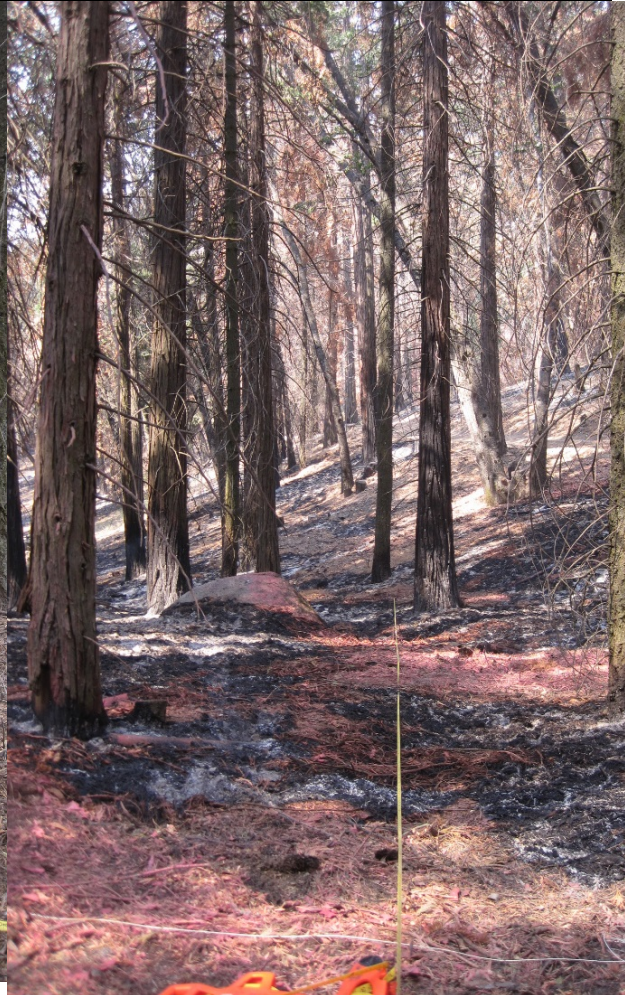
Plot 5 Transect 3, Post-fire, 50- 0ft