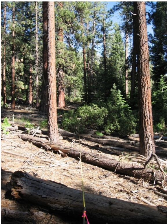
Plot 8, 0-50 ft, Pre