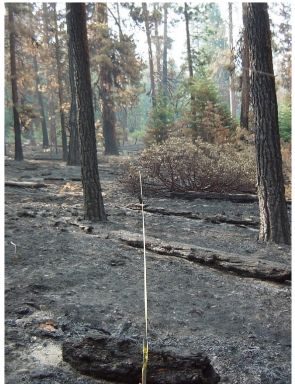
Plot 8, 0-50 ft, Post