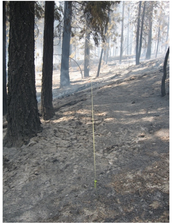
Plot 4, 0-50, Post