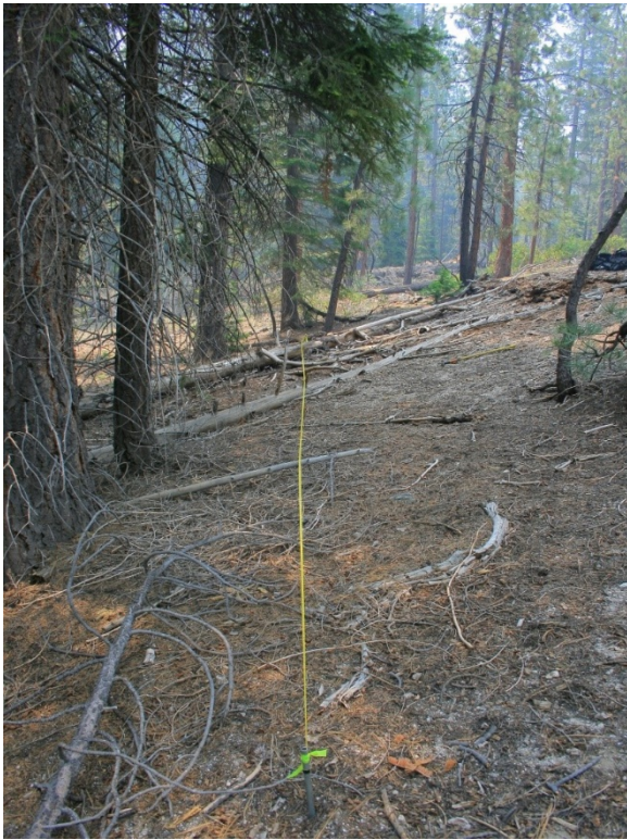
Plot 4, 0-50, Pre