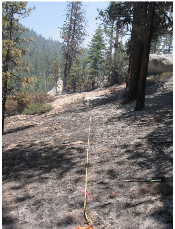
Plot 2, 0-50, Post