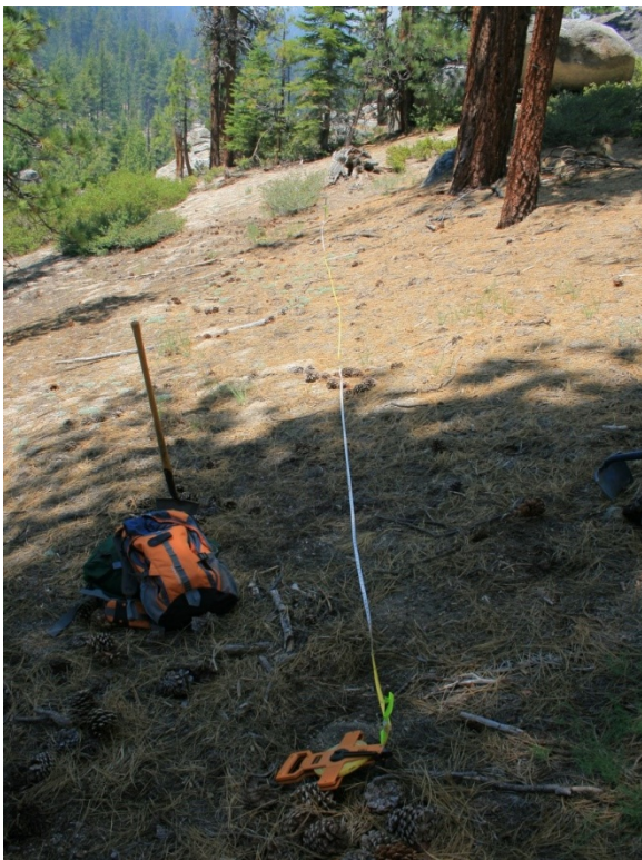
Plot 2, 0-50, Pre