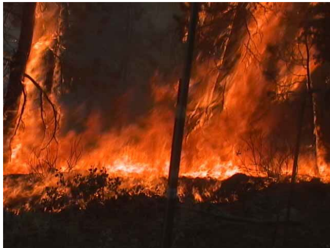
Clover Fire, Plot 5, 2008