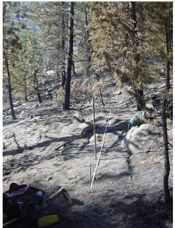
Plot 4, Origin, Post