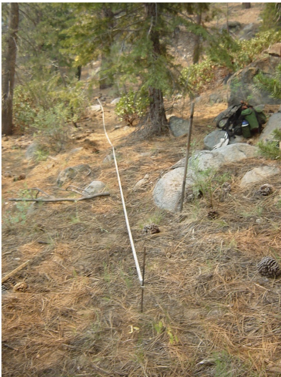
Plot 4, Origin Pre