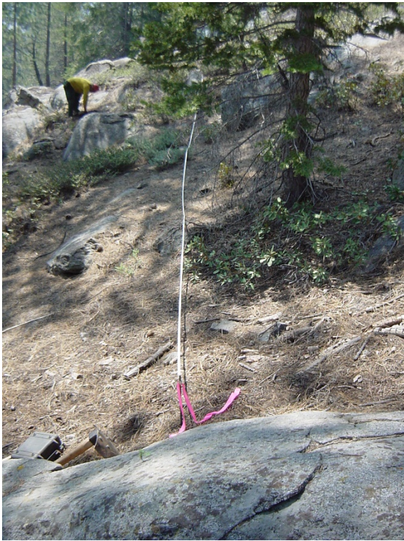
Plot 4, Origin Pre