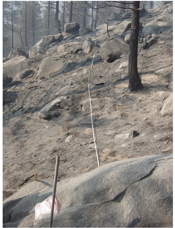
Plot 4, Origin, Post