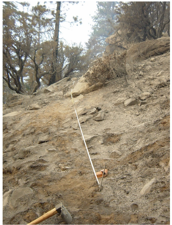
Plot 2, Origin, Post