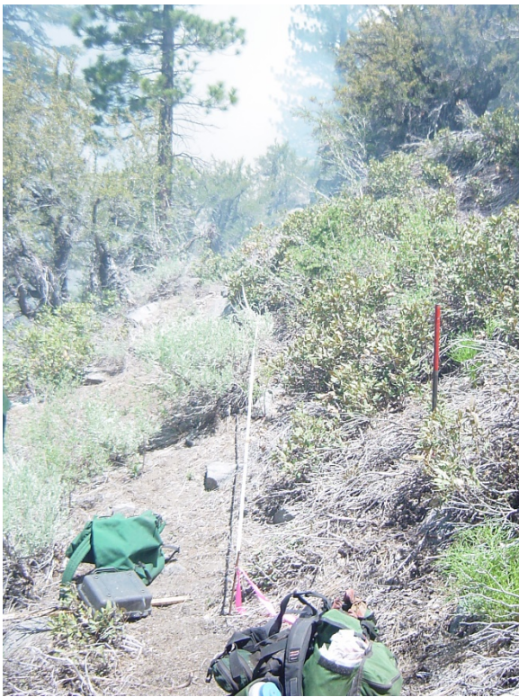
Plot 2, Origin Pre