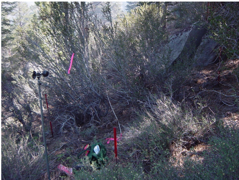
Plot1 1, Pre