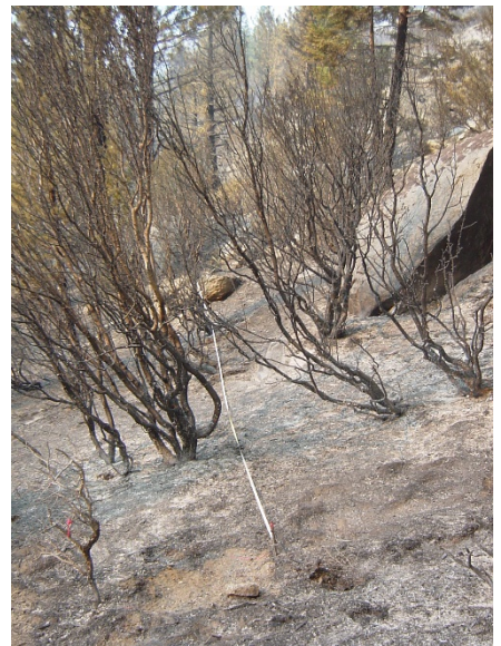
Plot 1, Post