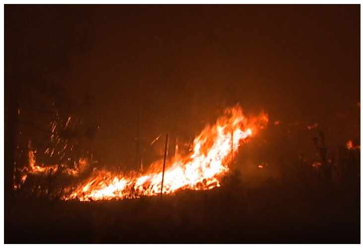
Surface fire, moderate intensity, with isolated torching.