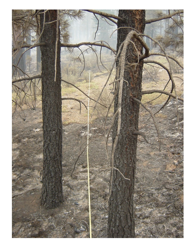
Transect 1, Post, 0-50 ft